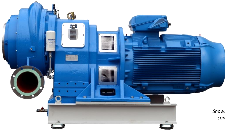
Shown model in console configuration with B5 flanged motor