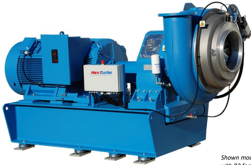
Shown model in basement configuration with B3 foot mounted motor (XY control)