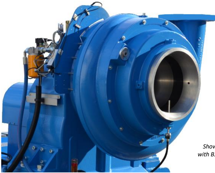
Shown model in basement configuration with B3 foot mounted motor and X control