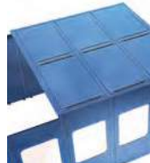
■ Roof modules