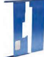
■ Sliding doors (automatic design)