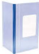
■ Corner modules