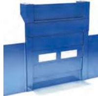
■ Lift gates (up to six segments)