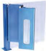
■ Folding doors (electric motor-driven under PLC control)