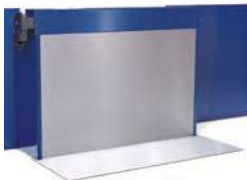
■ Roll gates with stainless steel lamellas (opens quickly, lightweight design)