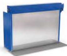
■ Roll gates (vertical/vertical- horizontal motion)