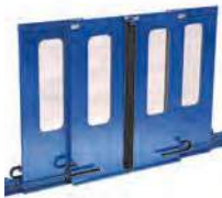
■ Sliding doors (telescopic design)