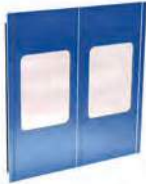
■ Window modules (with special glass pane insert)