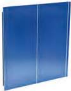
■ Wall modules (standard dimensions B x H 1235 x 2350 mm)